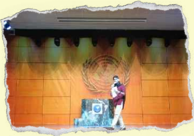
ISG: Bureau Girls- Dance