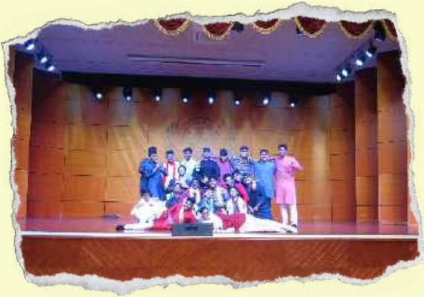
ISG: Bureau Boys- Dance